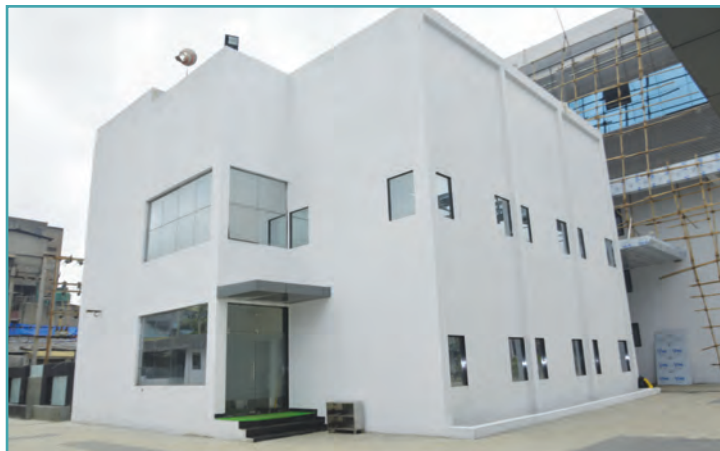
Quality Control Block